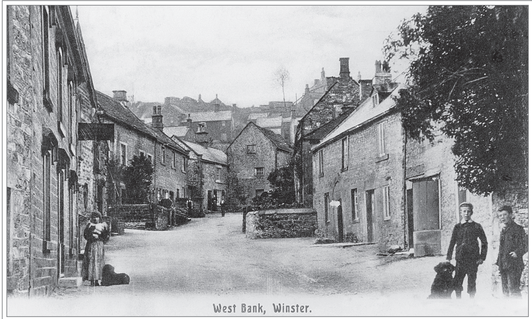
West Bank. The building in the centre is now demolished.

W inster is an ancient lead-mining village in the Derbyshire Peak District. It existed at the time of the Domesday Book (1086), and grew into a modest market community, until a boom in lead mining in the seventeenth and eighteenth centuries turned the village into a prosperous small town. Flooding in the mines became a problem as the workings got deeper, and eventually it forced many of them to close. The last working mine at Mill Close, two miles north-east of Winster, employed large numbers of local men until it closed in 1938. A number of the buildings on the imposing Main Street, some of which were once shops, date from the hey-day of mining. The two grandest buildings are Winster Market House (now owned by the National Trust) and Winster Hall. The cottages which huddle together on the hillside, known as Winster Bank, are more likely to have been the modest homes of the poorer miners, quarrymen and agricultural workers and their families. They spread out between two steep roads, East Bank and West Bank, and are linked by a web of narrow pathways. All around are mineshafts and grassy mounds left over from the period of lead mining. In the 1950s an estate of council houses was built at Leacroft, on the eastern approaches.