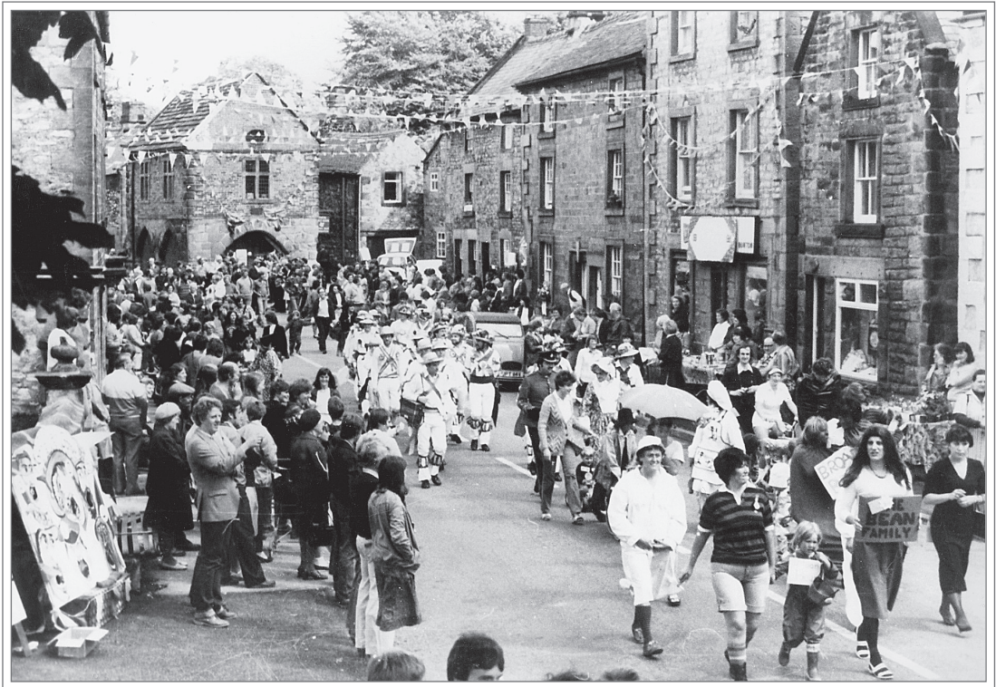
Carnival procession along Main Street on Wakes Saturday 1982. The building in the background is the Market House.

In contrast to past times, few of the residents now work in the village, and this fact, together with the rise of motor transport, has brought the demise of much of the old community. But although there has been change there has not been decline, for Winster is one of the most lively villages in the area, with a school, shops, a garage, two pubs, a church, two chapels, playing fields, a medical centre, a newly refurbished village hall, and many flourishing activity groups. Much of this liveliness can be experienced during Winster Wakes, especially on Wakes Saturday, which is usually the first in July.