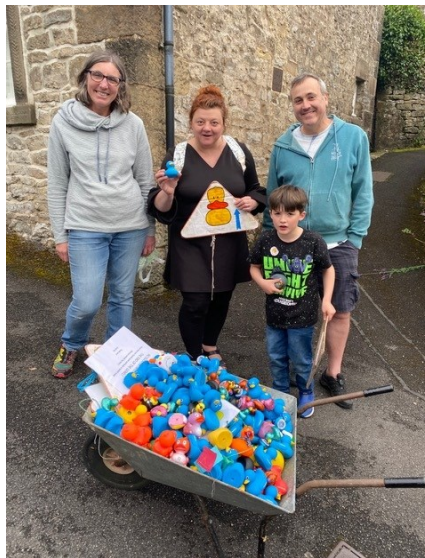
The organisers plus helper Ellis collecting ducks from the Duck Hunt.