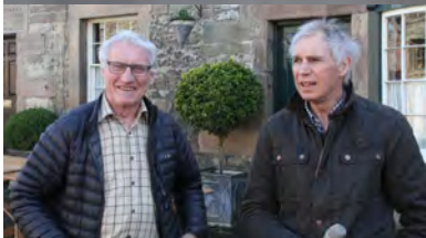
Winster Pancake Races 5th March 2019