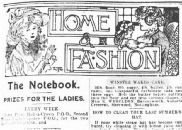
Original Recipe in 'Derbyshire Courier' - Saturday 14 March 1914

Rub the flour and butter together and add the sugar and currants, then mix to a stiff dough with beaten egg. Knead a little, roll out, and then cut into rounds the size of a saucer. Place on a greased tray and bake in a moderately heated oven until pale golden brown