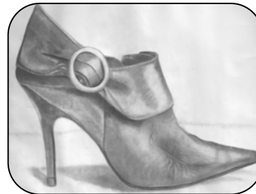
Drawing by Jade Roper

Need cash? Don't forget you can withdraw cash at the Post Office for the majority of British banks. You can even do cheque deposits for some banks. Visit https://www.postoffice.co.uk/branch-banking-services for full details of the services available for each bank.