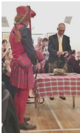
The piper plays as the address is delivered to the haggis.