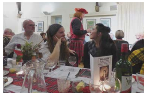
Over seventy people enjoying the evening.